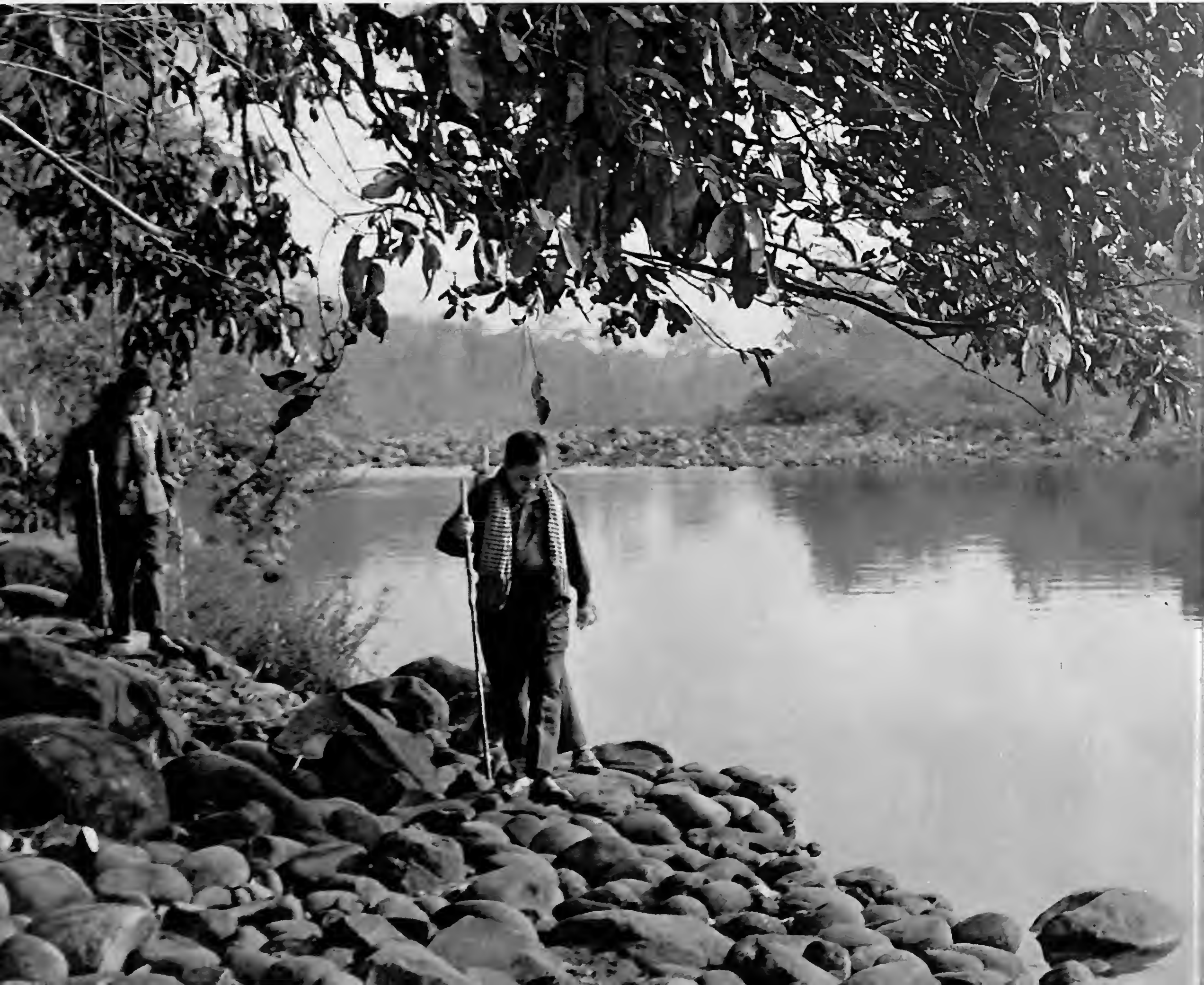
Proceeding toward a campsite near the border of Cambodia.